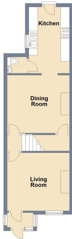
First Floor Approx. 32.4 sq. metres (348.2 sq. feet)